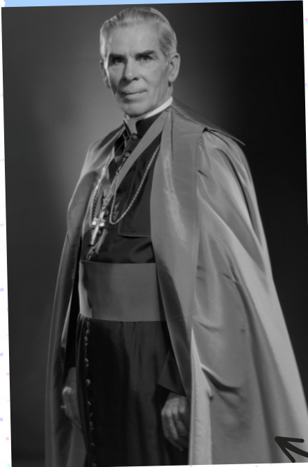
Ven. Fulton Sheen